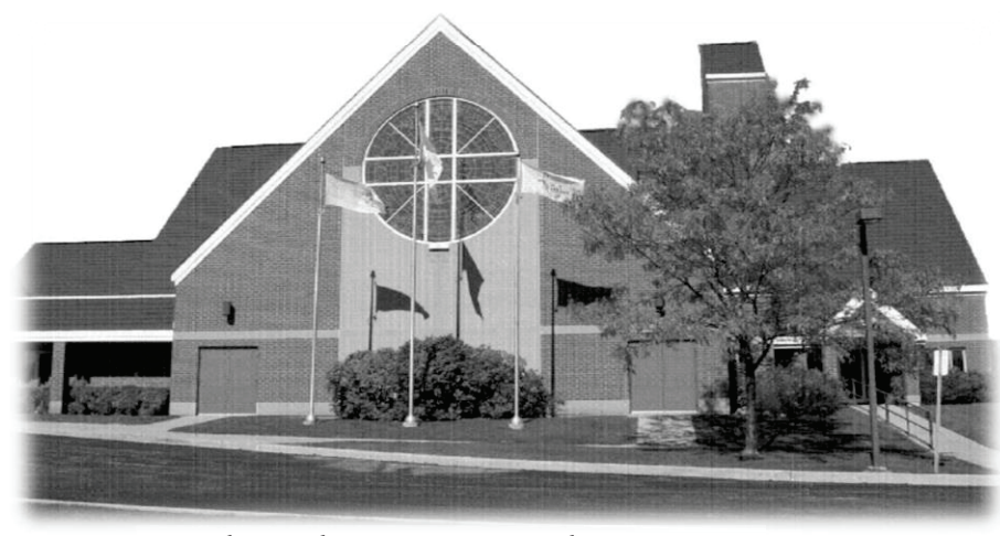
"... The seed is sprouting and growing ..." (Mark 4:27)

ST. VINCENT DE PAUL – White Box Collection on the last Sunday of the month. Call 519-571-8485 for information on food distribution.